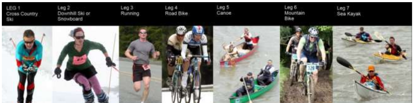
Media Kit for Ski to Sea